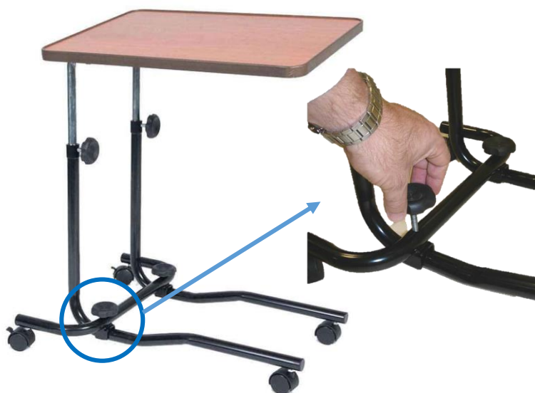
Figure 2 – Assembling the cross bar