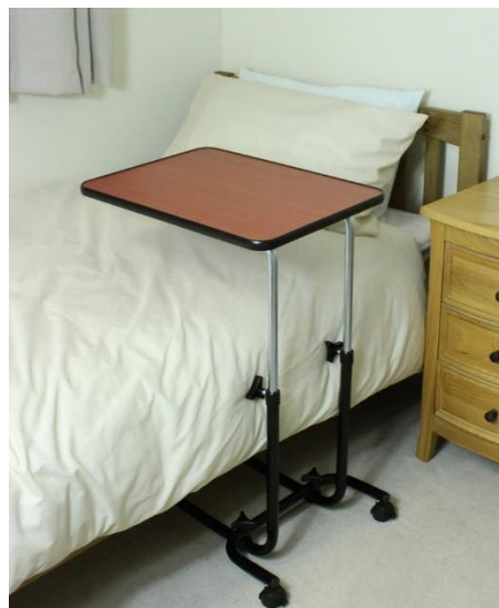
Figure 1 – In Use

Secure by inserting and tightening the two long hand wheels.